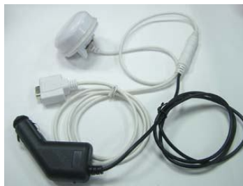
Model : GM62C