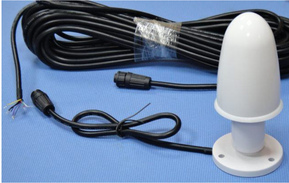
Garmin compatible Marine GPS Receiver

MTK MT3339 Chip GPS Marine Receiver with Full Waterproof