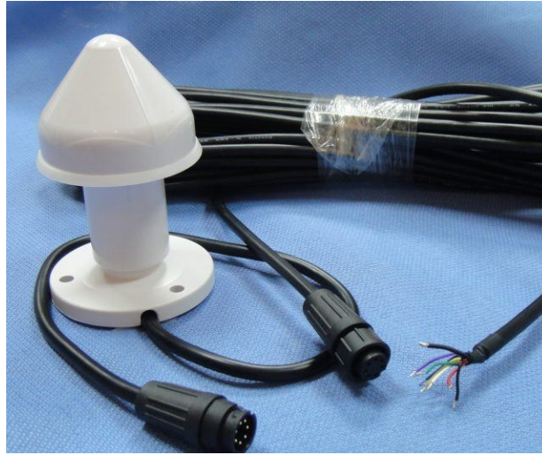
Garmin compatible Marine GPS Receiver

MTK MT3339 Chip GPS Marine Receiver with Full Waterproof